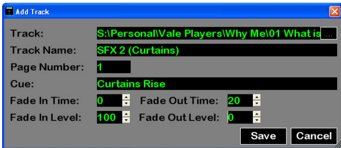
New Add Track Dialog with Fade Settings

As you may already have seen this last month we have rolled out our latest version of the software. This had been in a beta format for a while and numerous users tested it successfully, and pointed out a number of little things that we hadn't noticed. In the last week of November we released the latest version and it is now available for all to download. This version included the addition of hot keys, discussed in the previous news letter and also included updates in other areas which we felt were important. One area was the faders for each side of the desk. These were updated to work more smoothly with the Auto-fade and also so that users could fade using a scroll wheel on their mouse. So if you haven't got the latest version then please visit the website http://www.csmd.co.uk and download the latest version free of charge. Remember to read the updating CSMD document found in our downloads section first.